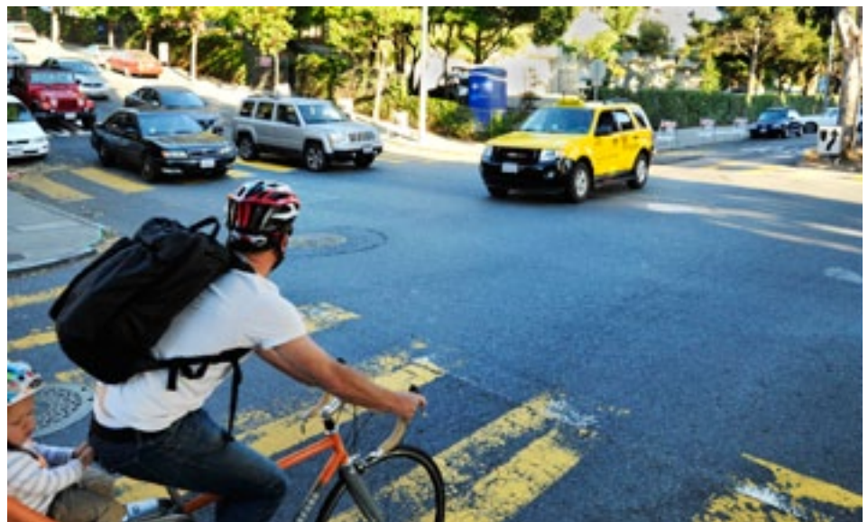
Ingredients for Tragedy

The list of dangerous intersections in our neighborhood is long: Church/14th/