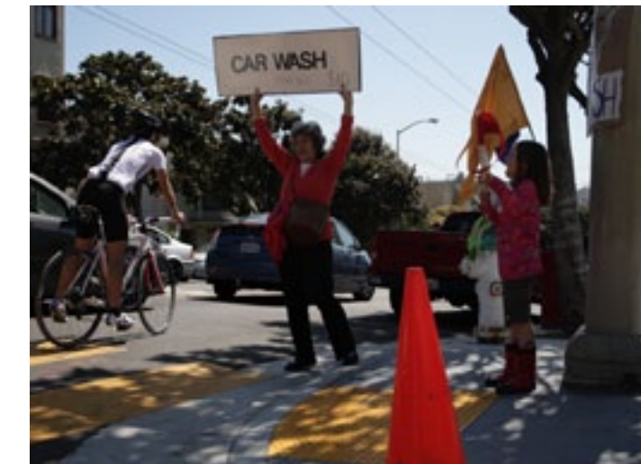
McKinley's annual car wash

On September 17th, McKinley Elementary recently hosted its annual car wash, which became a showcase for mayoral candidates. The car wash and accompanying bake sale was a huge success in terms of money raised for