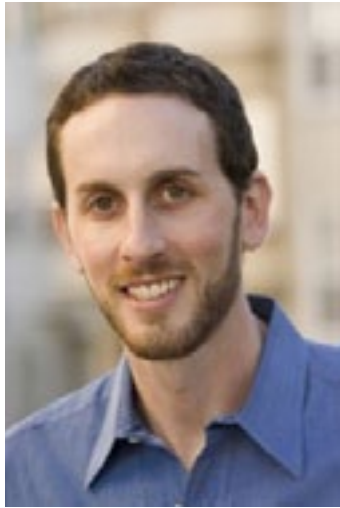
Scott Wiener San Francisco District 8 Supervisor

The past month has seen some very positive developments in the neighborhood, while also reminding us that we have work to do.