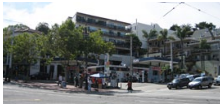
The RC gas station site at 376 Castro St

With the RC gas station site planned for new develop-