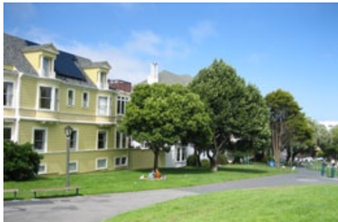
Several buildings in the proposed District directly about the park, which is unusual for San Francisco