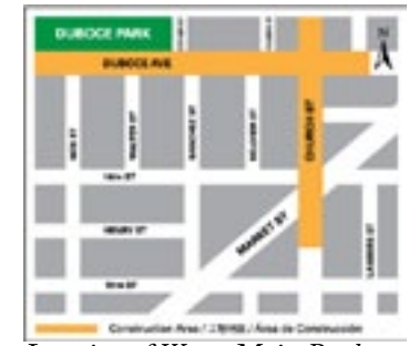
Location of Water Main Replacement

between 14th Street and Duboce Avenue. The work at each location will take approximately three to five weeks.