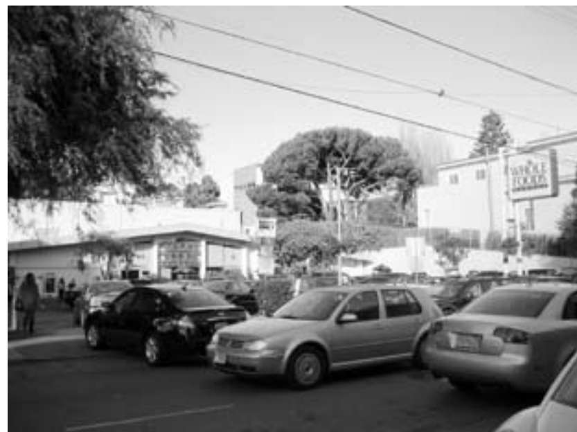
Sunday afternoon traffic at Noe Valley Whole Foods

The combined deficit in parking for both residential and Whole Foods is 139 on weekdays and 157 on the weekends. Where will these cars go?