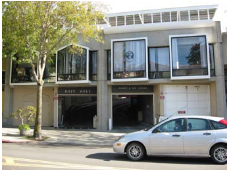
Trader Joe's pulls the plug on transportation study for a Market/Noe store, after learning of mandatory traffic queuing mitigation measures proposed by the city Planning Department.

For well over a year now, rumors have been swirling around the possible move-in of a Trader Joe's to the former Tower Records site on Market near Noe. There has been coverage along the way in the newspapers as well as in this newsletter. After an initial presentation from Trader Joe's, DTNA looked at the proposal from the perspective of our Formula Retail Matrix, and determined that there were both potential positives and negatives to the proposal.