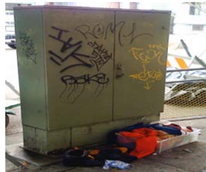
AT&T U-Verse boxes: Coming to a sidewalk near you?

Several years ago, DTNA joined many organizations in the city that helped push back against AT&T's attempt to place a large number of very large (2 1/2 feet wide by 4 feet deep by 4 feet tall) utility ("U-verse") boxes along the streets of our neighborhood and city.