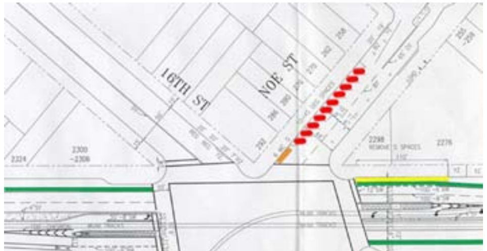
Map of proposed parking changes at Market, Noe and 16th Streets. Key follows article.

SFMTA proposes changes to Market between Valencia and 17th Street for expansion of the existing bike route network. These changes put into action the Policy and Planning for Sustainable Transportation in San Francisco.