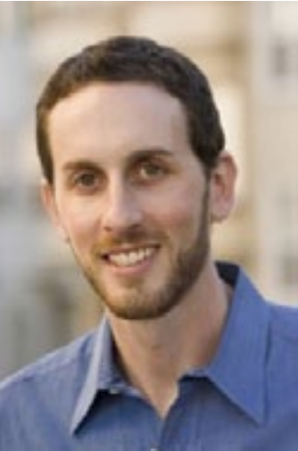
Scott Wiener San Francisco District 8 Supervisor

The placement of utility boxes on our neighborhood sidewalks has been an ongoing cause of concern. We all want to protect our sidewalks and keep them unobstructed, and we also have to comply with state law, which gives utilities the right to place boxes on our sidewalks. There's no easy solution.